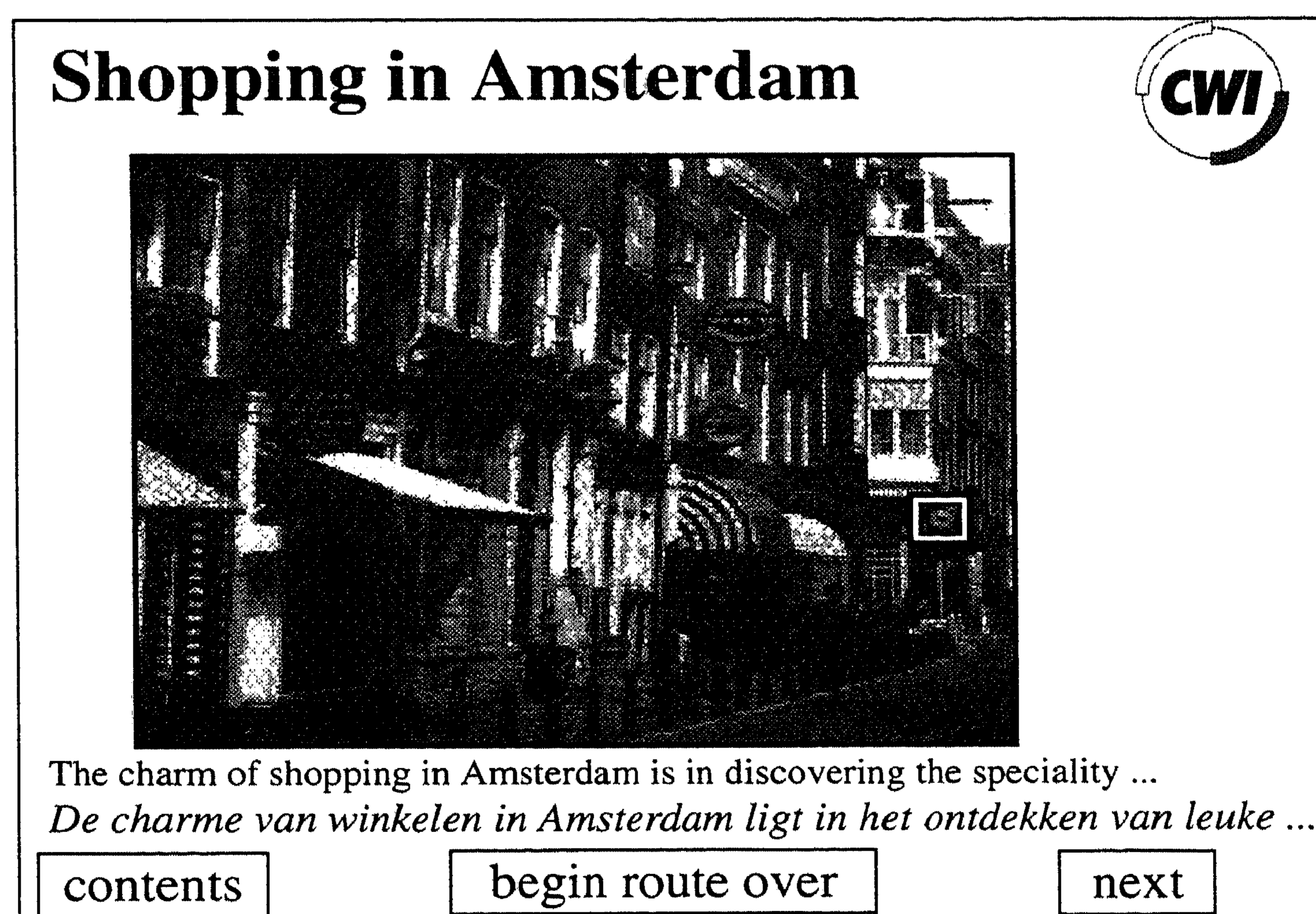
Figure 2. An example multimedia application.

The primary advantage of using a document model is that it provides an explicit behavioral specification. This behavioral description can be used to fetch individual data objects by a player, but it can also be used prior to execution to analyze expected application resource use and feasibility for a given environment [BZ92a]. Assuming